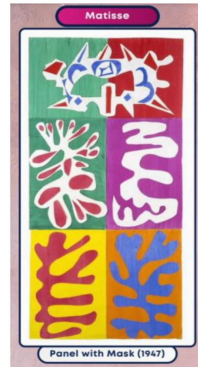
Panel with Mask (1947)