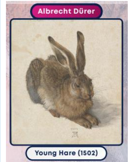
Young Hare (1502)