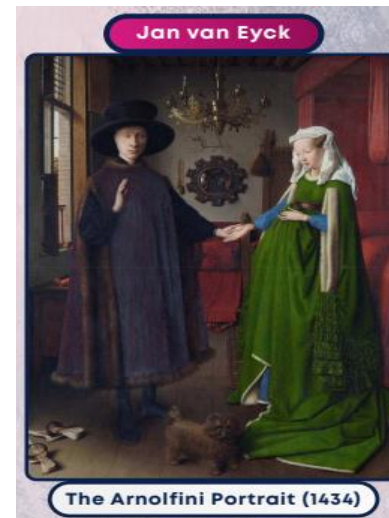
The Arnolfini Portrait (1434)