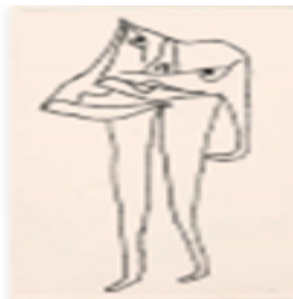
Paul Klee, Was Fehlt Ihm