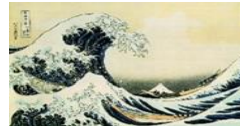
Katsushika Hokusai, The Great Wave off Kanagawa.