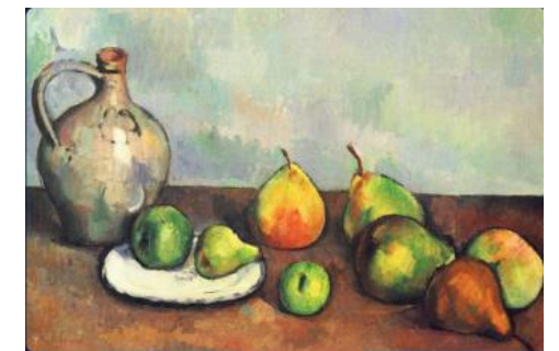
Still life, pitcher and fruit