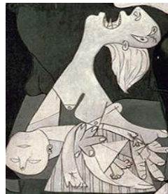
Pablo Picasso, Mother and Child