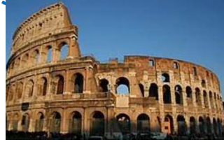
The Roman Empire at its greatest extent around 117 CE