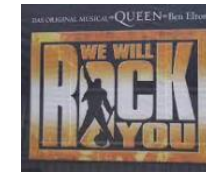
Queen We Will Rock You