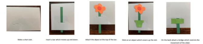
Making a lever