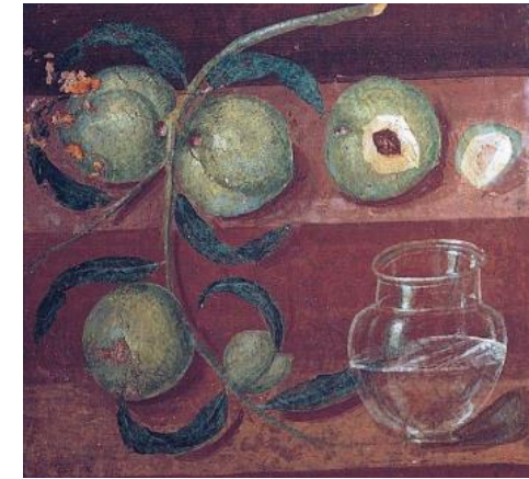
Still life with peaches and a glass (50CE)