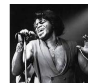
James Brown I Feel Good