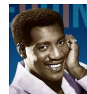
Otis Redding My Lover's Prayer