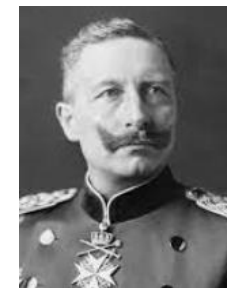
Kaiser Wilhelm II German Emperor during World War II