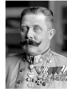
Archduke Franz Ferdinand. Heir to the Austro-Hungarian throne. Assassinated 1914.