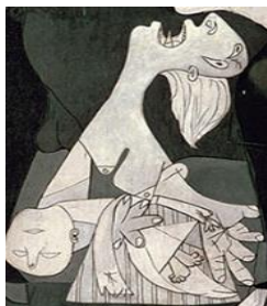
Pablo Picasso, Mother and Child