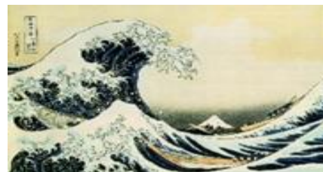
Katsushika Hokusai, The Great Wave off Kanagawa.