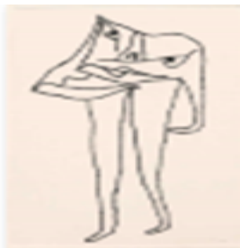
Paul Klee, Was Fehlt Ihm

You can use anything to print the same picture over and over again in different ways.