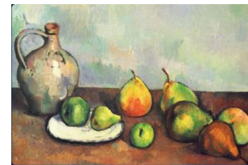
Still life, pitcher and fruit