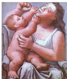
Mother and child