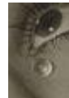
Man Ray's Glass tears (1932)