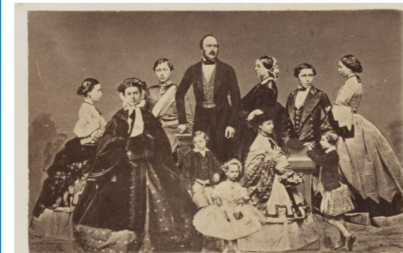
Photomontage: Prince Albert of Saxe-Coburg- Gotha, Queen Victoria and their children (circa 1861)