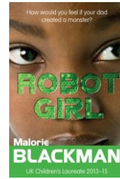
Robot Girl by Malorie Blackman.