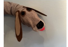
The finished puppet An extra feature (a long tongue) has been added and glued in place