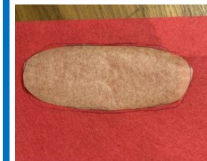
Using the template to draw around on fabric