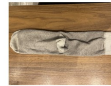
The back of the sock showing the heel