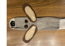
Adding the features with glue