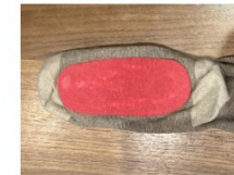
Gluing the inside of the mouth down