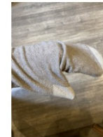
Trying out the sock Thumb in the heel space and fingers in the toe space