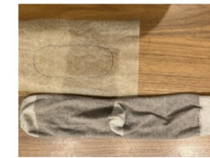
Drawing of a template for the inside of the mouth