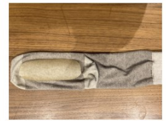
Trying out the template It needs to fit between the heel and the toe of the sock