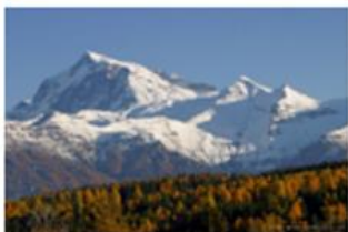
The Alps (Europe)

Fold mountains are one type of mountain. They are formed when two or more tectonic plates are pushed together.