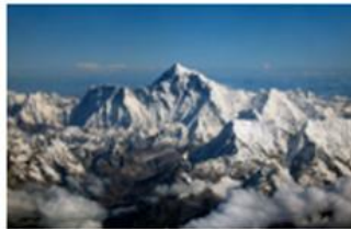
The Himalayas (Asia)