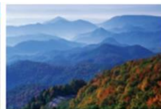
Blue Ridge Mountains (USA)