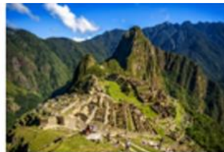
Machu Picchu (Peru)