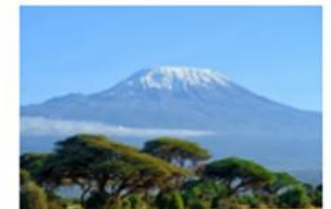
Mount Kilimanjaro (Africa)