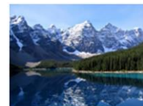
Rocky Mountains (Colorado)