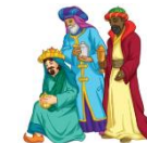
Wise men / kings