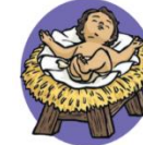
Jesus in a manger

Different symbols from the Christmas Story that are important to Christians.