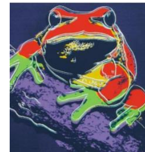
Andy Warhol Pine Barrens Tree Frog. Screen Print 1983.