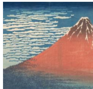
Hokusai South Wind, Clear Sky Woodcut 1830- 32