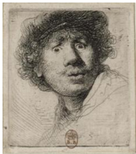
Rembrandt Self-portrait in a cap, wide-eyed and open-mouthed. Etching and dry point. 1630

When creating linocut prints, your design will be mirrored when printed. The raised (uncut) areas will transfer ink, and the sunken (cut) areas will be left uncoloured.