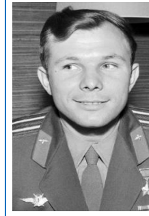
Yuri Gagarin Soviet pilot and cosmonaut who became the first human to journey into outer space.