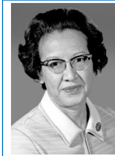
Katherine Johnson Great mathematician who worked for NASA, enabling space flight.