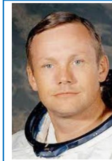
Neil Armstrong American astronaut; first man to walk on the moon.