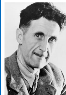
George Orwell Famous writer; wrote Animal Farm and 1984.