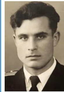
Vasili Arkhipov Prevented the start of a nuclear war during the Cuban Missile Crisis.