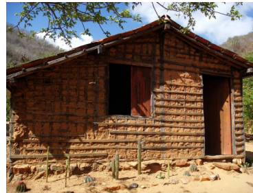
A wattle and daub house in China

The Silk Road — different routes from Europe to Asia.