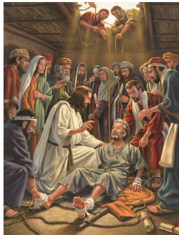
Jesus and the paralysed man