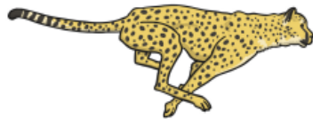
The cheetah ran quickly .