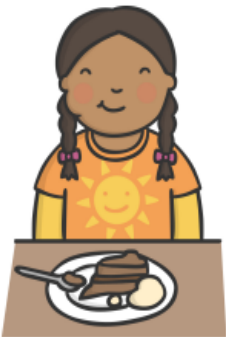
She ate her dessert slowly .

An adverb describes a verb, adjective or another adverb.