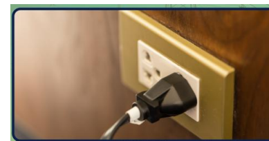
Plug and socket