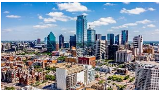
Urban: Densely populated Lots of buildings