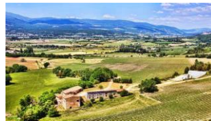
Rural: Less populated. Lots of open spaces