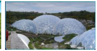
The Eden Project