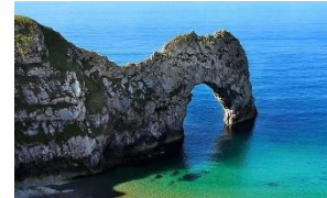
Durdle Dor- coastal erosion.