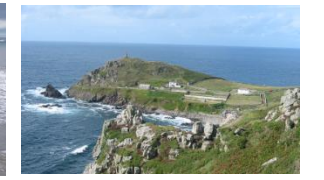
Cape Cornwall Bays and rugged cliffs