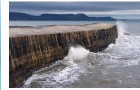
Lyme Regis The Jurassic Coast