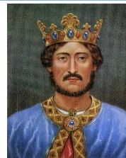
Richard the Lionheart

King of England who became known as the 'Lion Heart', he was famous for his exploits in the Third Crusade. However, during his 10-year reign, he spent only six months in England.