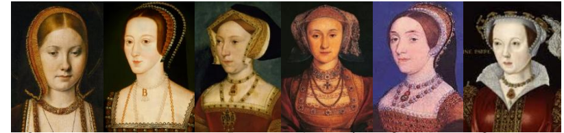
Catherine of Aragon Anne Boleyn Jane Seymour Anne of Cleves Catherine Howard Catherine Parr

divorced beheaded died divorced beheaded survived