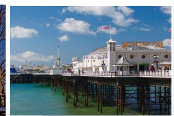
Palace Pier, Brighton