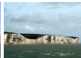
The White Cliffs of Dover