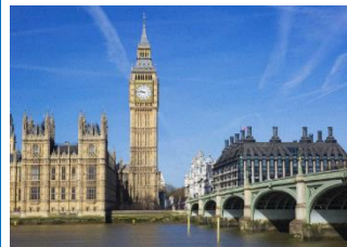
The Houses of Parliament, London