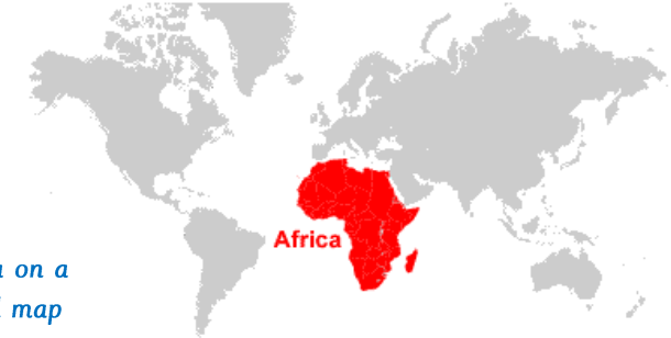
Africa on a world map

Africa is the world's second-largest continent, after Asia. It's also the second-most populous continent (which means it's the continent with the second-most amount of people living there). 16% of the world's human population (1.216 billion in 2016) live there! It also covers 6% of Earth's total surface area and 20% of its land area. The continent is separated into two by the Equator; most of Africa lies in tropical regions, with the Tropic of Cancer at the north and the Tropic of Capricorn at the south of the continent.