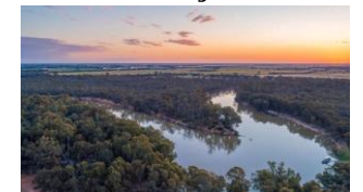
River Murray, Australia