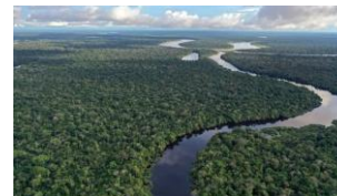
Amazon River, Brazil