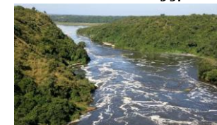
River Nile, Egypt