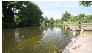
Little Ouse, Brandon