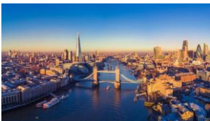
River Thames, London