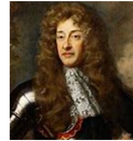
King James II

Argued with parliament and sent them home so he didn't have to listen to them.