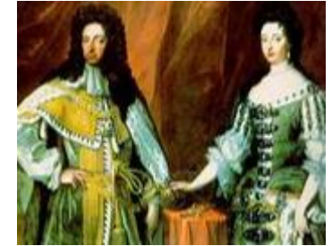
William and Mary

Signed the bill of rights when they became King and Queen