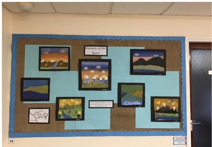
Blackbirds, Space in Art